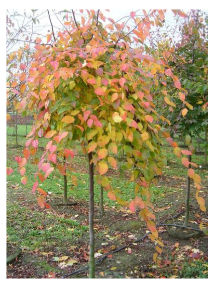
Friday, November 2, 2018

Ginter Park Woman's Club 3016 Seminary Avenue Richmond, Virginia