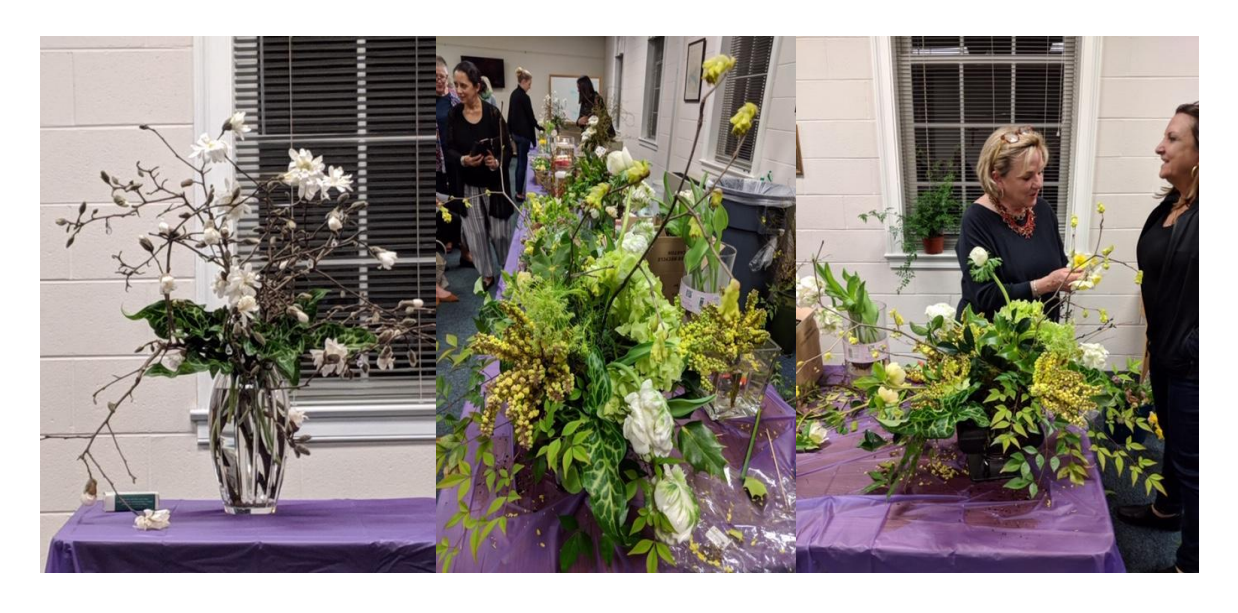
Pictures from presentation by Meg Laughon at the Westham Garden Club on March 14, 2019.