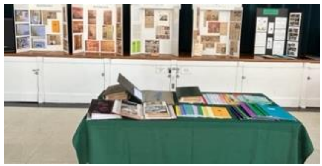
Historical articles, documents, scrapbooks, yearbooks, newsletters, applications for awards