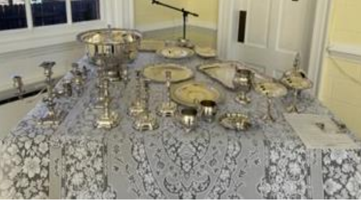
RCGC Silver for Sale - (All Sold)